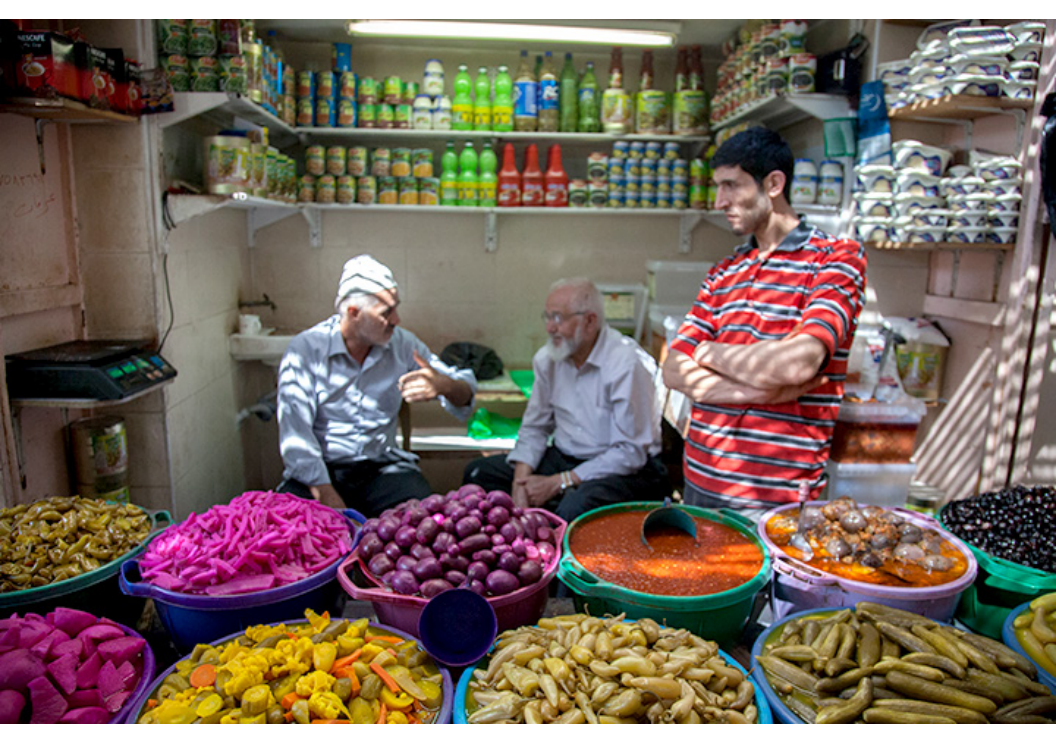
Vendors sell pickled vegetables and olives at a market in the city of Hebron.

Wherever we work, MCC is on the side of a just peace between societal groups or people in conflict. MCC does not choose one people group over another. "MCC does 'take sides' with the good news of Christ that reconciliation between enemies is possible and that reconciliation involves the doing of justice. MCC does 'take sides' against all forms of violence, regardless who perpetrates it.