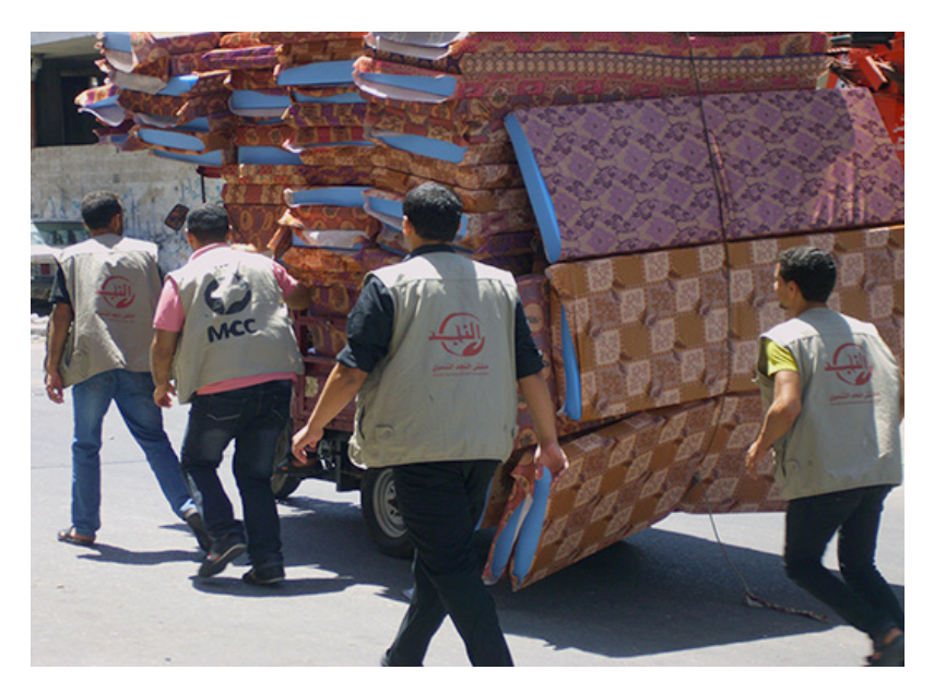
Volunteers wearing MCC and Al Najd Development Forum vests deliver mattresses to families who opened their homes to other Gazans displaced by the Israel-Hamas conflict in 2014. MCC provided bedding and related supplies distributed through partner organization Al Najd.

Gaza's situation is particularly difficult. The Gaza Strip is 40 kilometers (25 miles) long and, at its widest point, 13 kilometers (8 miles) wide. Since 1994, Israel has enclosed Gaza with a fence on three sides and by control of the Mediterranean Sea on the west. In 2006, Palestine elected Hamas (an Islamist militant group) to govern, though ultimately their political leadership was confined to Gaza. Some voters favored an Islamic state,