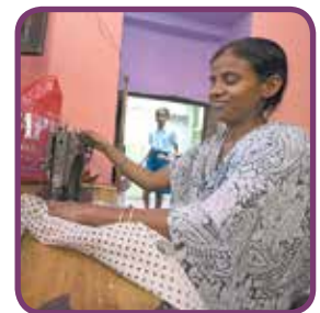
Her mother, a seamstress, works in the family's one-room home.